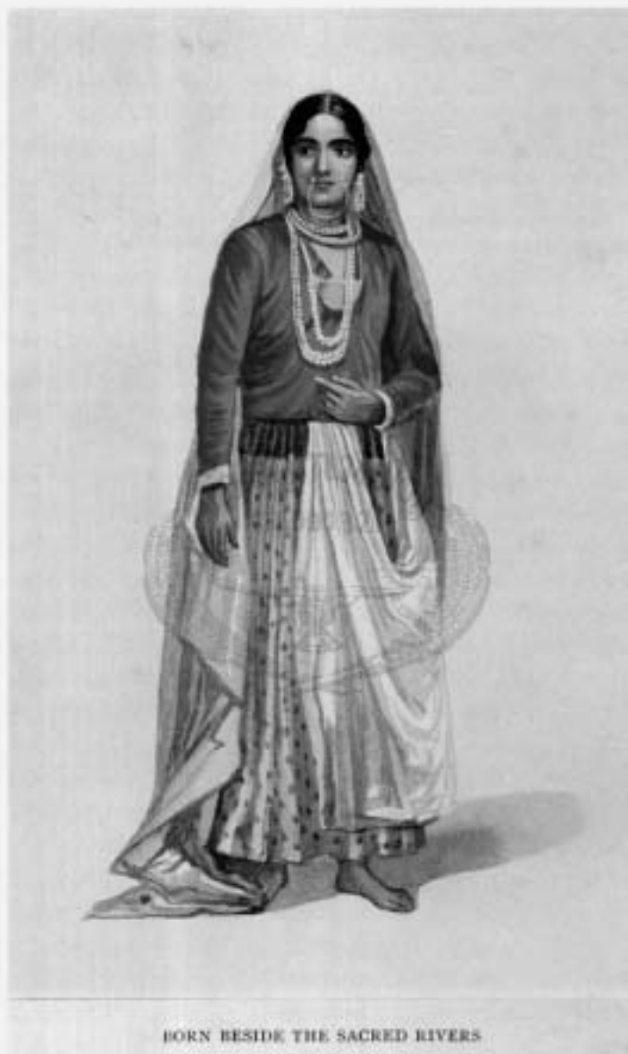
BORN BESIDE THE SACRED RIVERS